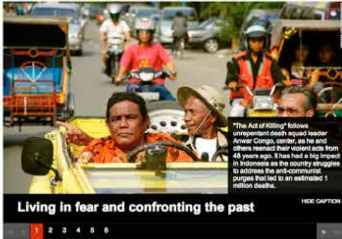
"The Act of Killing" follows unrepentant death squad leader Anwar Congo, center, as he and others reenact their violent acts from 48 years ago. It has had a big impact in Indonesia as the country struggles to address the anti-communist purges that led to an estimated 1 million deaths.

September 30, 2013 — Updated 0817 GMT (1817 HKT)