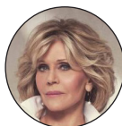
Jane Fonda @janefonda Academy Award-winning actress, producer, author and activist