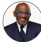
Al Roker @alroker

Vice President of Strategic Communications & Informed Communities, Gates Family Foundation