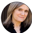
Amy Goodman @democracynow Journalist & co-host of Democracy Now!